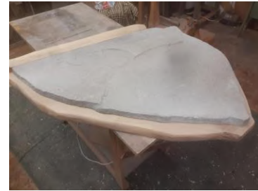
Here the frame around the stone is assembled, the glue blocks cut off and the surfaces attended to. I had to do some stone carving to the underside to make it nestle into the frame nicely.