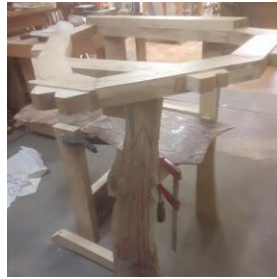
There is a wooden barrier all around the stone to and legs with carvings below. Here the parts are fit together without glue and I'm still deciding how to arrange the legs to support a lower level.