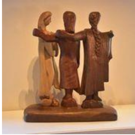
and this is the rear view of the sculpture. Picasso didn't have to worry about that, but I did.