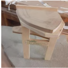
I made a scale model of the stone and made three scale models of how I might design the table. This photo is of the model they liked, and the final design is a variation of it.

The project below, three photos, is of an outdoor table for a barbecue pit at the same property as the Spider Bedroom set. I began by shopping for stones at a stoneyard and going from there. Carvings on the table will commemorate their son proposing to his bride to be, an event that took place by a long abandoned fire pit that now has a small tree growing out of it. The front leg, middle photo, will be carved as the fire pit, and we are still deciding how to depict the event. There's a good bit of improvisation in a project like this.