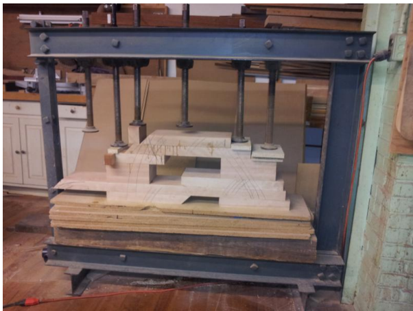
The pieces have been final milled, cut to match the template and are in my press making the stack lamination