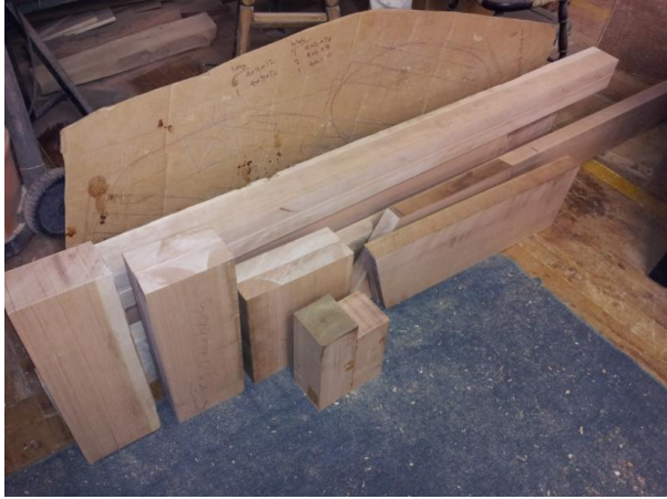
Rough milled lumber with the cardboard template in the background