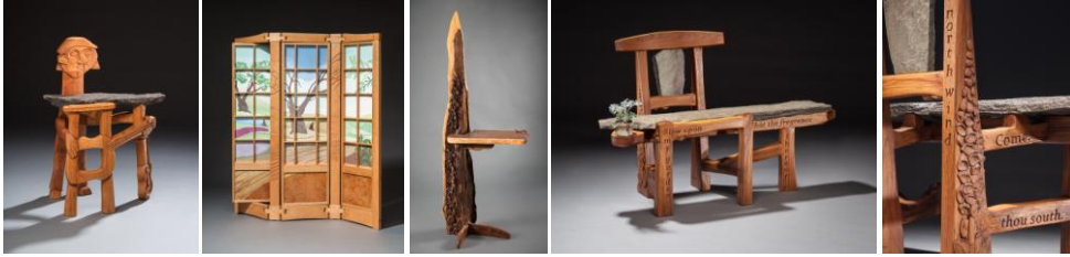
Busker, 3 Quotes from Ovid, Ants Totem, Fragrant Flow, Fragrant Flow detail.

Now here are some progress photos of the mirror with iris's and a butterfly.